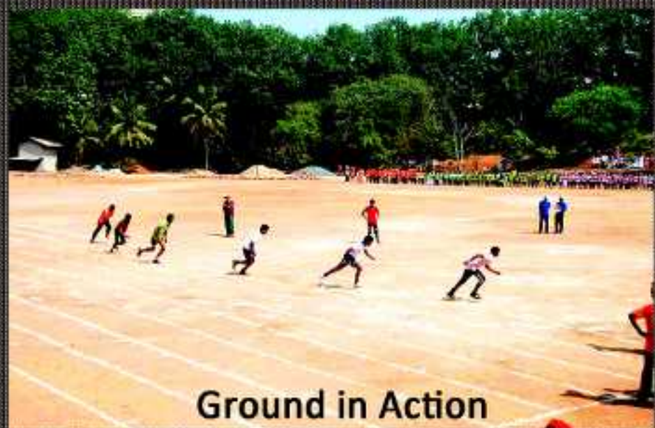
Ground in Action